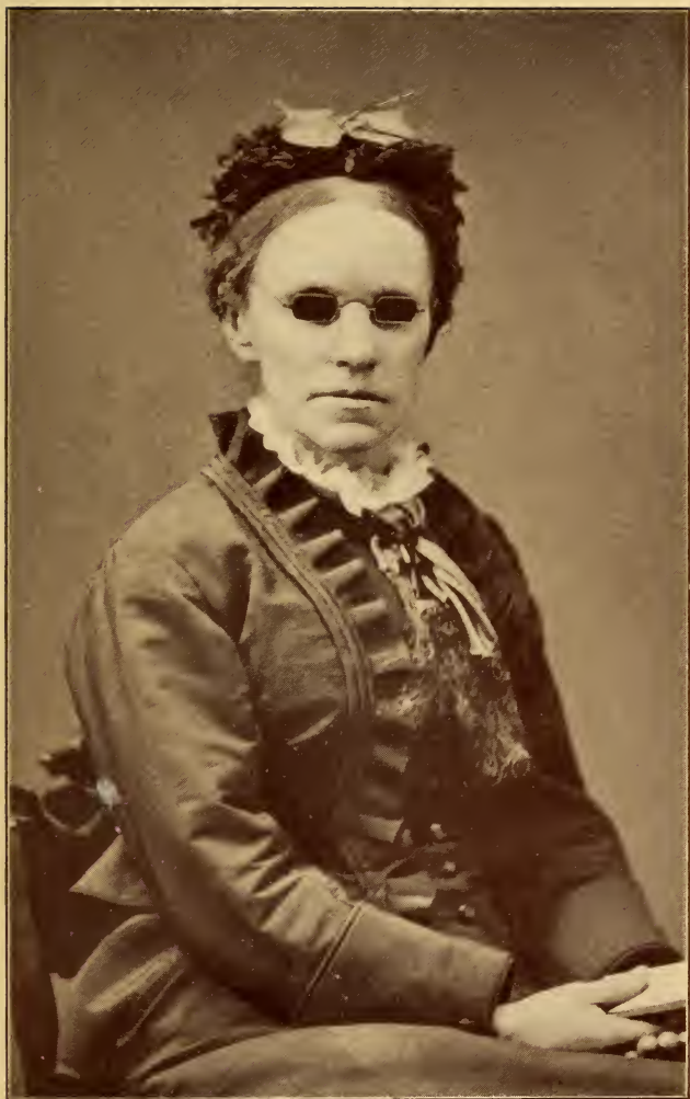
Fanny Crosby as she was in 1872